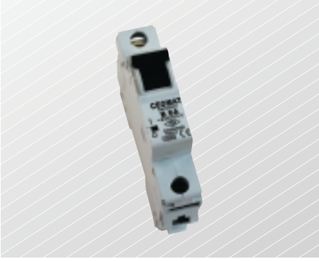
Kutup Sayısı No of Poles