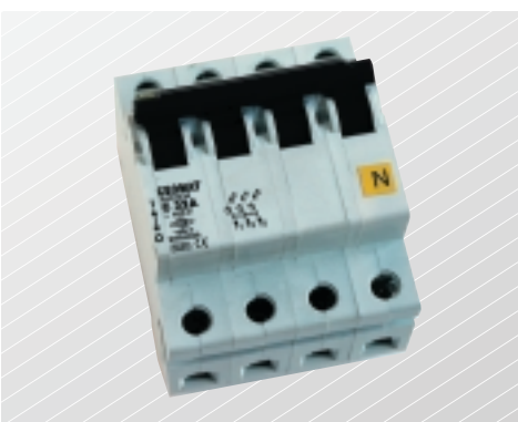
Kutup Sayısı No of Poles