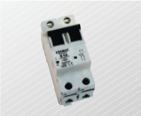
Kutup Sayısı No of Poles