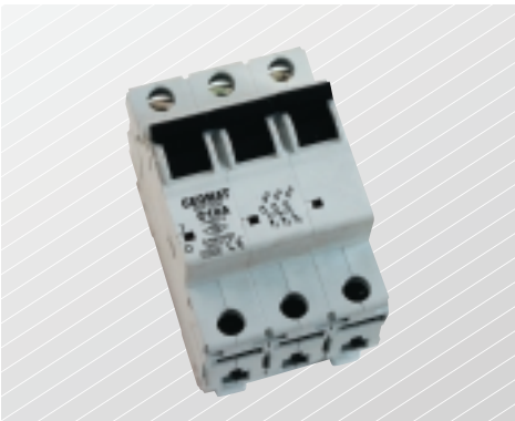
Kutup Sayısı No of Poles