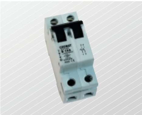
Kutup Sayısı No of Poles