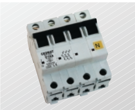
Kutup Sayısı No of Poles