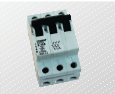
Kutup Sayısı No of Poles