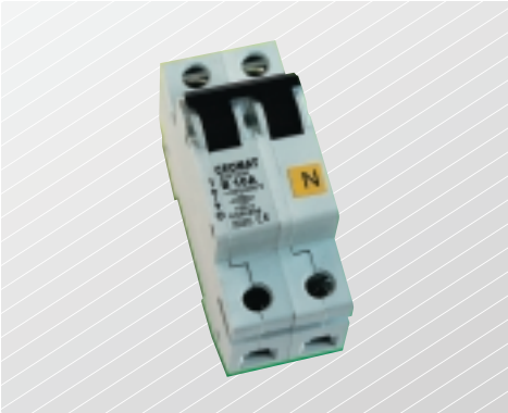
Kutup Sayısı No of Poles