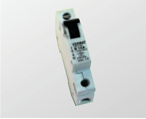
Kutup Sayısı No of Poles