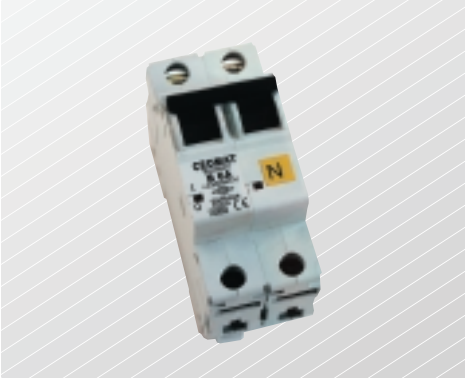
Kutup Sayısı No of Poles